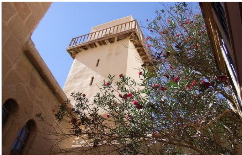
Plate (3) The Fatimid Mosque inside the monastery of St. Cathrine, Sinai.