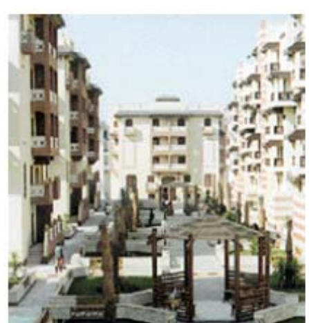
Figure (2) Future Housing Project, a new emerging (re)generated housing.