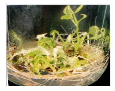
Fig. (3): Transgenic green shoots of bean Fönix variety growing and rooting very well on double selective MS rooting medium containing 50 mg/l kanamycin and 1 M/l mannitol.

Fig. (2): Selection of stable kanamycin resistant and mannitol stress tolerant transgenic green shoots of bean Fönix variety growing on double selective MS regeneration medium containing 100 mg/l kanamycin and 1.2 M/l mannitol.