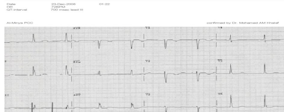
Fig. (2): A 12-lead electrocardiogram of a 32 female patient 4 hours after CO exposure (COHb = 27 %) showing a prolonged QT interval. The longest QT interval was measured at 700 msec in lead III.