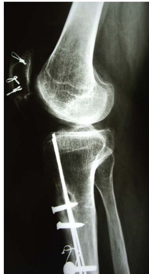
Fig. 7. Five year postoperative radiograph showing complete incorporation of the graft, patellar high, and slightly distally displaced graft.

Various methods of reconstruction of the patellar tendon have been described. If sufficient patellar tendon is left for repair, augmentation