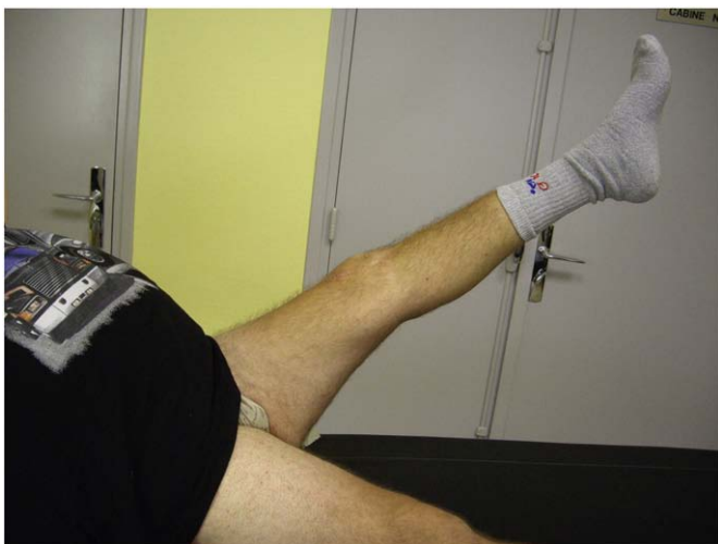
Fig. 5. Five years postoperative picture showing patient's active full extension.

We represent a case of failed primary repair of a ruptured patellar tendon in a patient with OI. In the literature, OI has been associated with tendon rupture, it is commonly bilateral and occurring at osseous insertion sites [5–12].