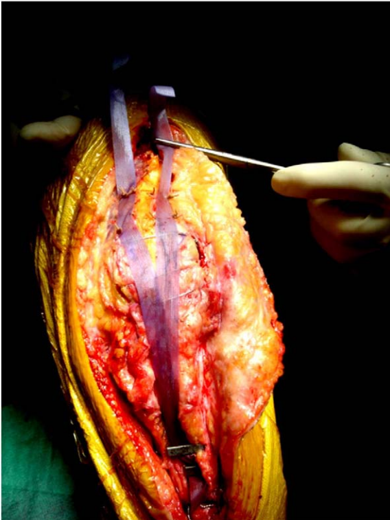
Fig. 4. Intraoperative picture showing the PDS® band augmenting the reconstruction.

no activity restriction. Radiographs (Fig. 7) showed complete incorporation of the bone parts of the allograft. The graft had migrated distally but patellar height was within normal limits, Caton–Deschamps [3] ratio of 0.95 and Blackburne & Peel [4] 0.86. The IKDC subjective knee evaluation score at five years was 58.5%. He described his knee function as optimal compared to pre-operative state where he was unable to perform activities of daily living.