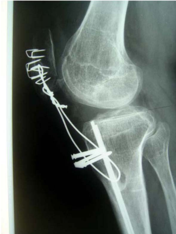
Fig. 1. Preoperative lateral view of the left knee. Note Patella alta and evidence of previous surgery.

easily. We planned to lower the patella 15 mm by moving the fixation of the allograft within the prepared tibial gutter as required.