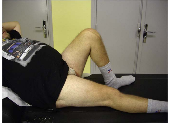
Fig. 6. Five years postoperative picture showing patient's full flexion.

Surgical intervention to repair a patellar tendon rupture is essential to restore the continuity and function of the extensor mechanism [13]. In chronic cases, the patella is retracted proximally and may require extensive surgical release to draw it distally to the appropriate level. Pre-operative assessment of patellar height is essential for proper planning of the procedure.