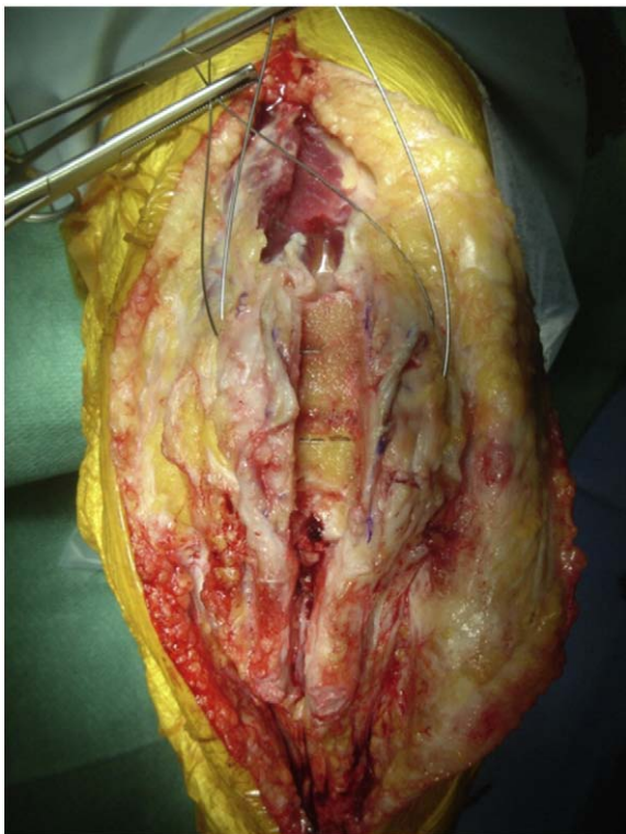
Fig. 2. Intraoperative picture showing the prepared bed in the patella ready to lodge the graft. Note trapezoidal shape of patellar gutter with the wide base inferior.

A complete extensor mechanism allograft was ordered which consisted of the quadriceps tendon, patella, patellar tendon and a tibial